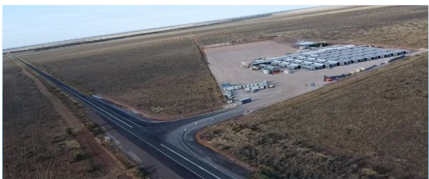
Aerial image of the Cobb Highway Camp taken in November 2024.

All work will be carried out in line with the project's Conditions of Approval and Construction Environmental Plan.