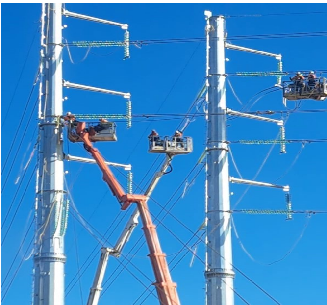
High voltage work on Line 4 between the Buronga substation, NSW and Red Cliffs substation, VIC.

Elecnor Australia has been contracted by Transgrid to deliver part of EnergyConnect with the construction of 700km of new power lines from the SA border to the regional energy hub of Wagga Wagga. The project will connect the electrical grids of New South Wales, South Australia, and Victoria, improving reliability of our nation's energy supply.