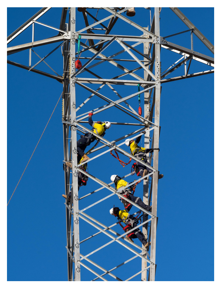
Riggers work at a tower at Buronga.

To register your expression of interest including your cover letter and resume, and or ask any questions please email <a href="mailto:legacy100@elecnor.es">legacy100@elecnor.es</a>